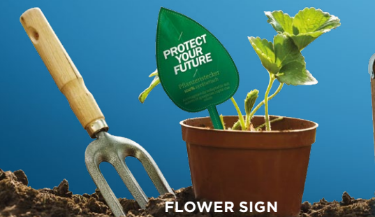
FLOWER SIGN YUPOBLUE®