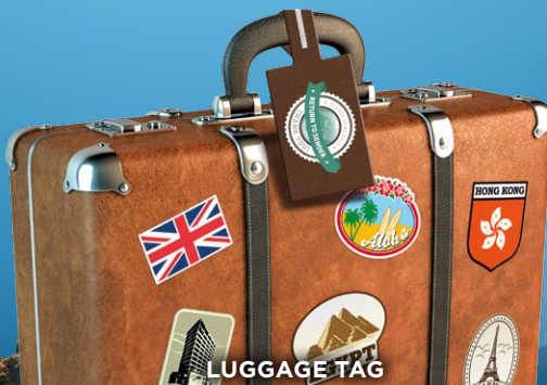
LUGGAGE TAG YUPOBLUE®