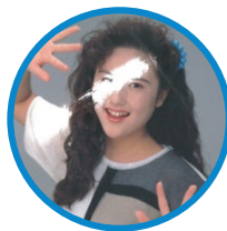
After 24 h in water rubbed 100x with wet cloth